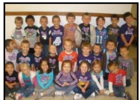
Jefferson Kinderstart students wear Purple Ribbons!

Mom to Mom Sale, IHS Gym, 9 to 1 p.m. Fundraiser for IAAB