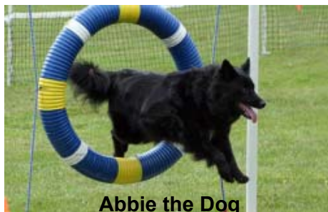
Abbie the Dog