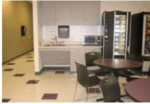
Student Break Area