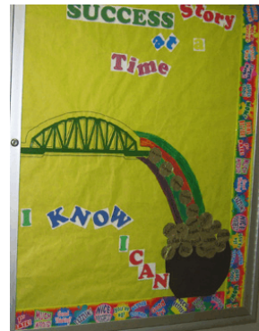
Motivational Bulletin Board