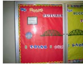
Motivational Bulletin Board