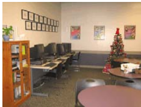
Library Computer Lab