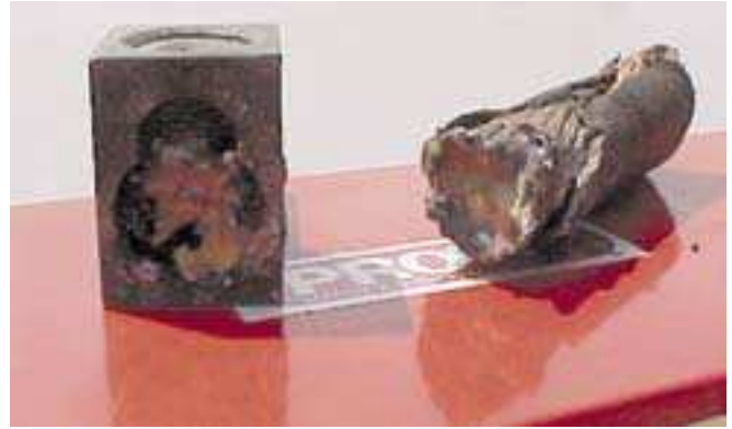
Destroyed mechanical terminal and fine-stranded cable from a large, utility-interactive PV system.

In some cases, it may be easier to parallel two smaller conductors to carry the same current as one larger conductor. The NEC only allows paralleling of