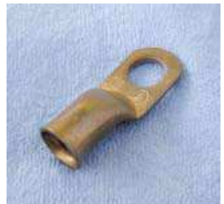
A typical compression lug—not marked for fine-stranded cables.

Fortunately, some manufacturers have recognized the termination issues related to fine-stranded wire, and modern designs use stud, rather than setscrew terminals on equipment typically used in conjunction with fine-stranded