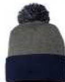
Pom Pom Cap - Navy Dk. Heather Grey/Navy