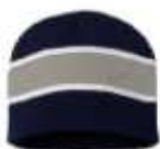
Striped Beanie Navy/White/Grey