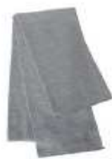
Solid Heather Grey