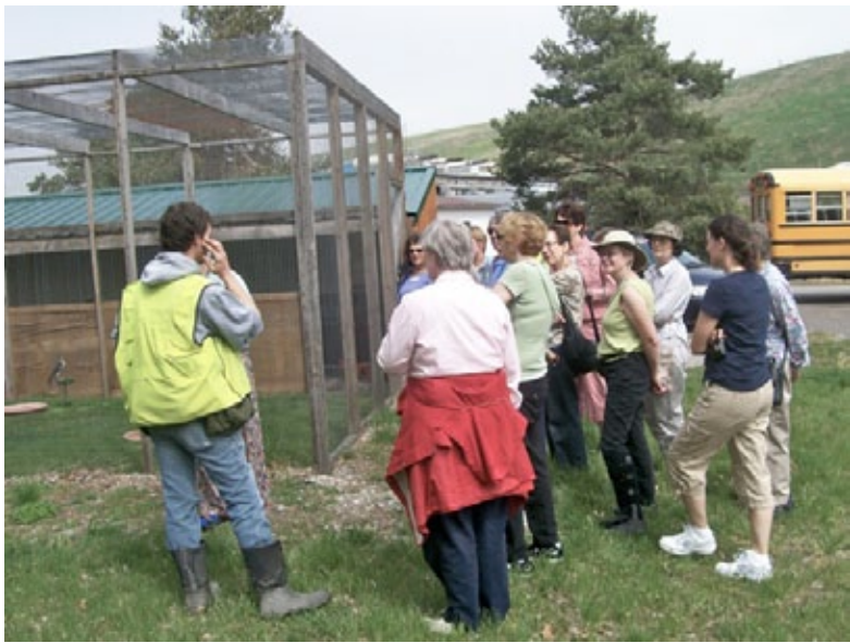
Go-See Tour at High Acres Landfill: The group at the Falconry where a landfill employee explains the use of falcons to drive away sea gulls.