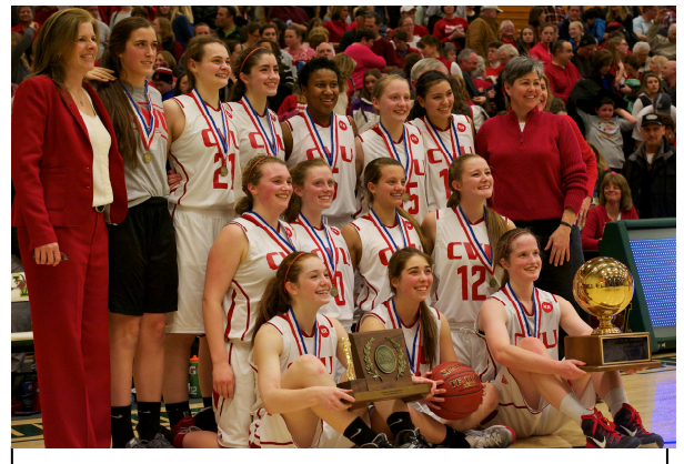
3-time State Champions 2013, 2014, 2015!