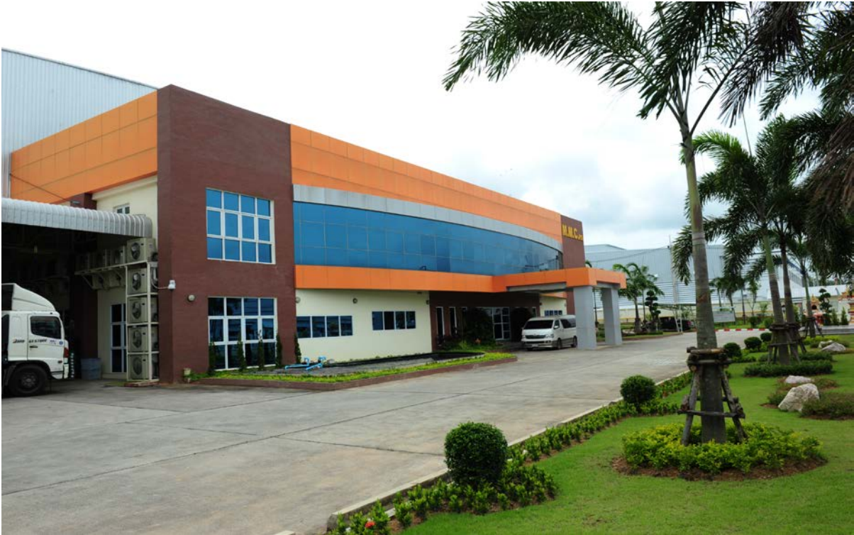
C: Photo(s) of the Product / Technology in this box