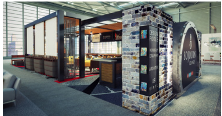
SOJOURN LOUNGE BY DESIGN POOLE