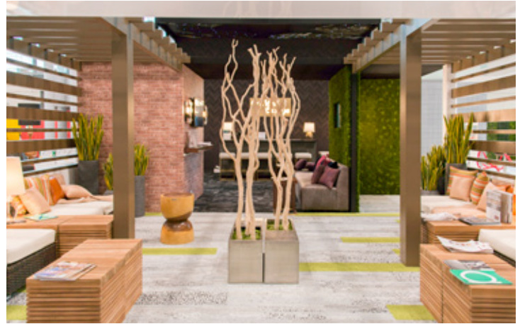
CITYSCAPE BY DESIGN GROUP CARL ROSS