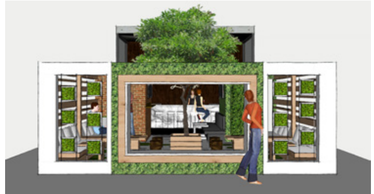
CITYSCAPE BY DESIGN GROUP CARL ROSS