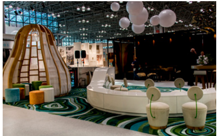
IMBIBE, A LOUNGE BY HOK