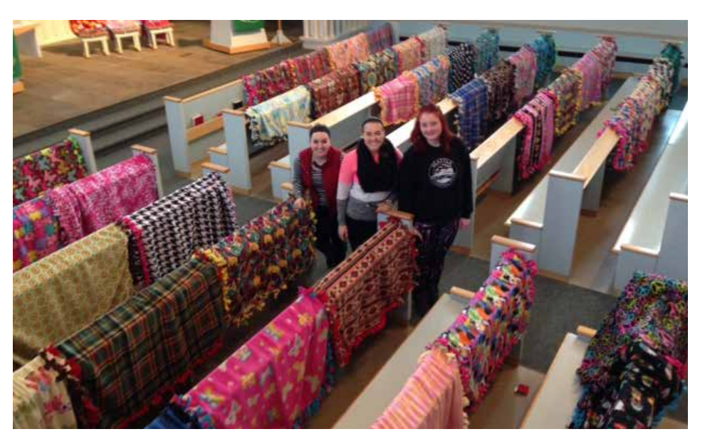
Wartburg College students stand among dozens of fleece blankets displayed in the Wartburg Chapel. Wartburg students created the blankets during St. Elizabeth Week to give to youth residing at the Bremwood campus of Lutheran Services in Iowa.