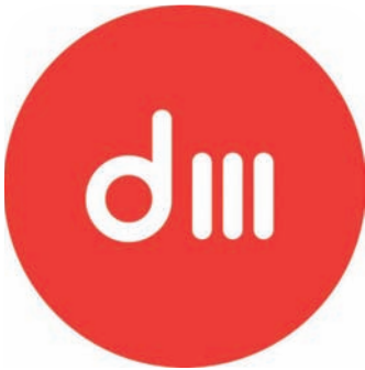
Deaf Fellowship: New logo for Deaf Missions just released in October

The Deaf Fellowship at FCOB has been a long-time supporter of Deaf Missions, a Christian nonprofit organization that is committed to bringing Jesus Christ to deaf and hard of hearing people in the United States and abroad. Their mission is very dear to our hearts because less than 1% of deaf people in the world know Jesus Christ as their Savior. Deaf Missions focuses on 3 areas of ministry: 1. preparing and distributing Bible visuals for deaf people; 2. training Christians – both deaf and hearing – to minister among deaf people; and 3. doing personal work among deaf people.