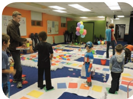
Thursday's Table at our fall costume party and Giant Candyland

We prayed together for each person who would receive our items, that each may know the love of the Father and be blessed. It is our hope to continue to offer intergenerational service opportunities for our youngest members of FCOB to serve, connect with the church body and grow closer to God.