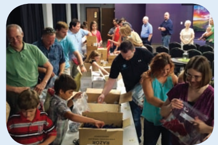
On Sunday August, 16, 2015 after The Basement service, attendees stayed to put together Hygiene Kits to be given to The Frederick Rescue Mission and the Alan P. Linton Jr. Emergency Shelter.