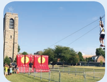
A zip line was one of the many inflatable options at FCOB's Picnic in the Park in Baker Park in August.

The event concluded with a viewing of the classic movie, "The Princess Bride," shown on a huge, inflatable screen. The picnic's success can only be described as "Inconceivable!"