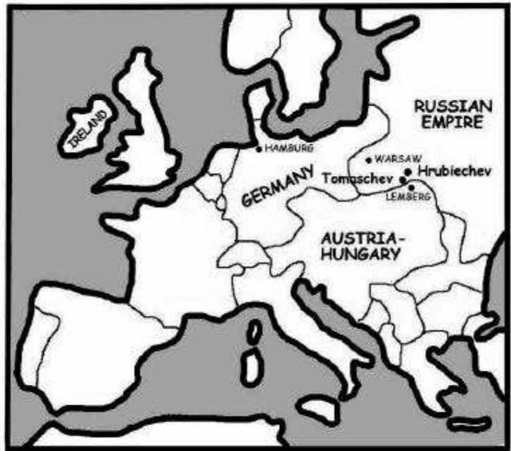
Europe in 1910