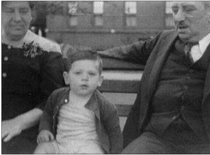
The author with his subjects during an early research session, 1944.