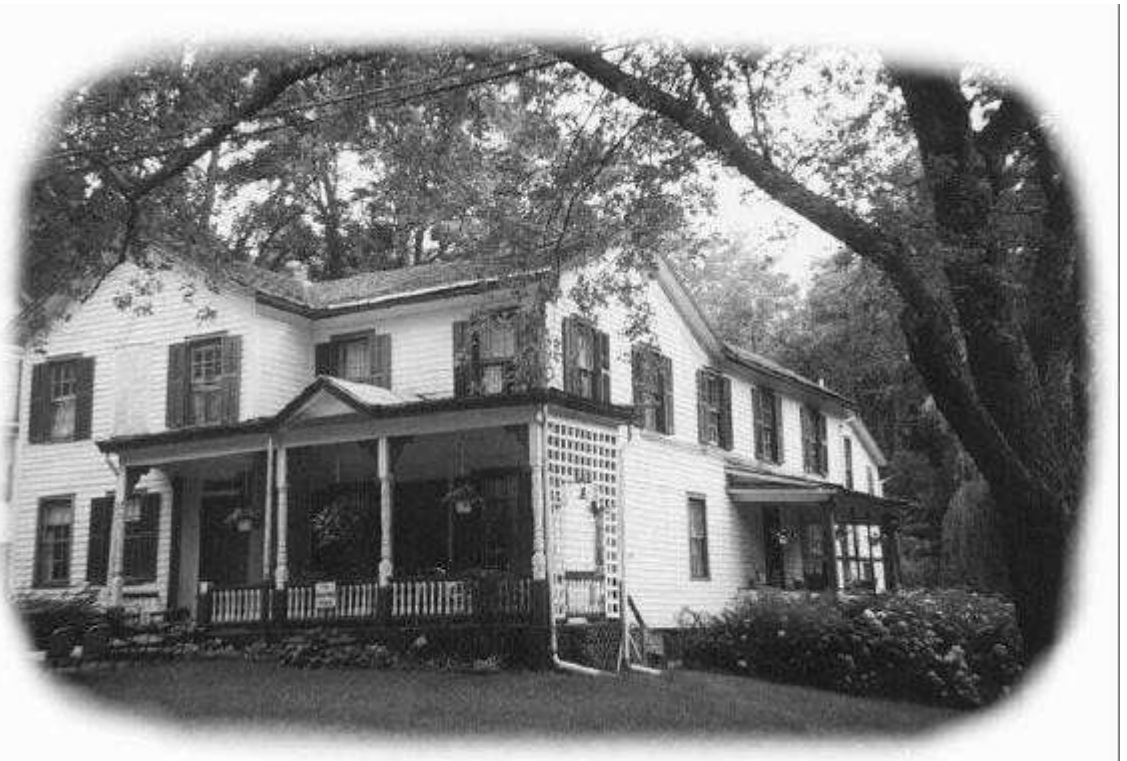
177 Union Street, Sharon Springs The Brustman House as it looks in 2000, essentially the same as in 1944.