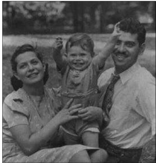
The first grandchild with his parents