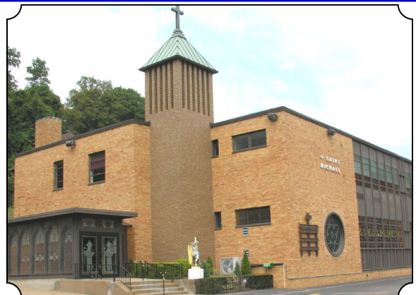
St. Michael Church 750 Wall Ave • Pitcairn, PA • 15140 412-373-2610