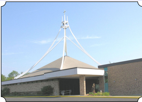
North American Martyrs Church 2526 Haymaker Rd • Monroeville, PA • 15146 412-373-0330

North American Martyrs is a vibrant parish, built on multi-generational and cultural traditions blended through the grace of the Holy Spirit. Reflecting the unconditional mercy of Jesus Christ, we as a faith community sharing God's love with all people, enthusiastically reach out to embrace everyone, especially the poor, broken, suffering and lost. We draw our strength through prayer, listening to and acting upon God's Word and celebrating the Eucharist, to foster a closer relationship with Christ as humble and faithful members of His Universal Church.