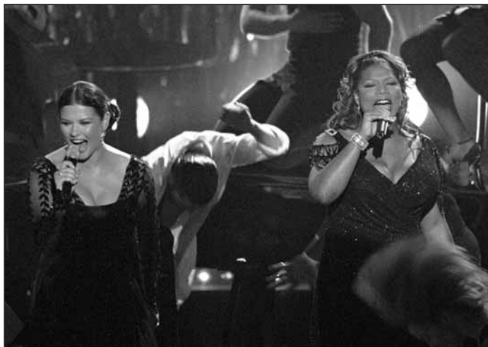
Catherine Zeta Jones and Queen Latifah sing the Oscar-nominated song "I Move On," by John Kander and Fred Ebb, during the telecast of the 75th Academy Awards.

While movie scores are usually written after the film has been completed, songs and song scores for musicals are written and recorded before filming begins. (Often a musical