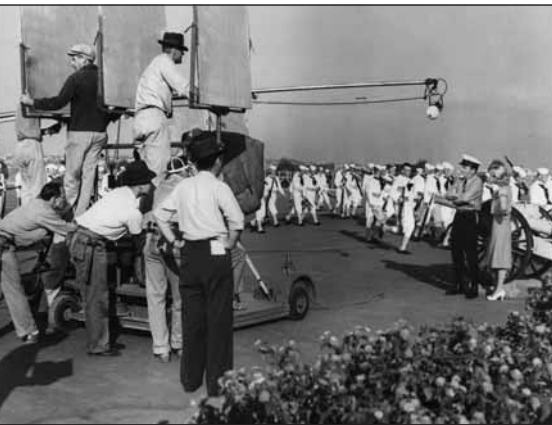
A microphone boom captures the voices of actors Virginia Weidler and Dickie Moore during the filming of Paramount’s 1935 film Peter Ibbetson .

Not all film dialogue is recorded live. Automated Dialogue Replacement or ADR is used to record new dialogue if the live track is unusable or if the director wants to change some of the actors’ lines. During ADR, actors watch a scene many times and practice matching the words to the lip movements of the characters onscreen.