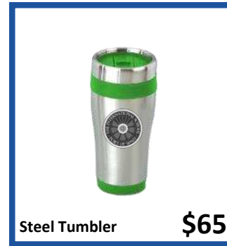
Steel Tumbler $65