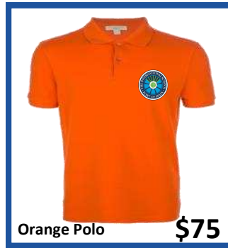
Orange Polo $75