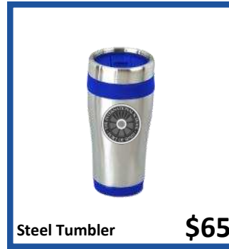
Steel Tumbler $65