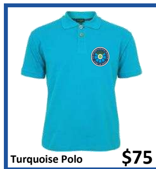
Turquoise Polo $75