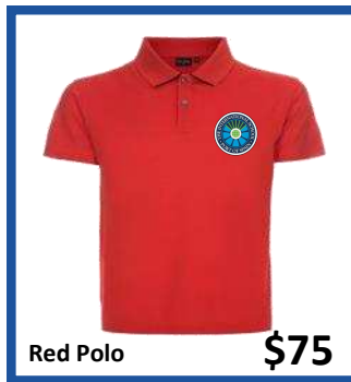
Red Polo $75