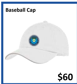
Baseball Cap $60