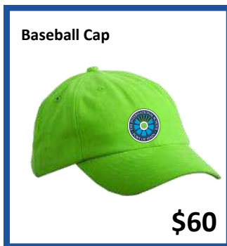
Baseball Cap $60