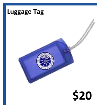
Luggage Tag $20