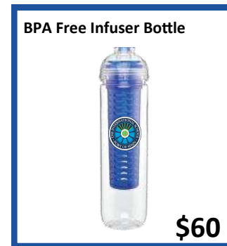
BPA Free Infuser Bottle $60