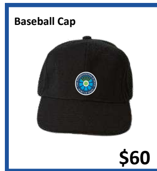
Baseball Cap $60