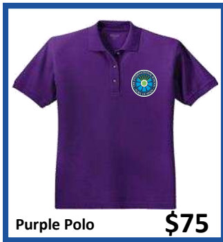
Purple Polo $75