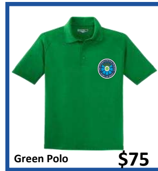
Green Polo $75