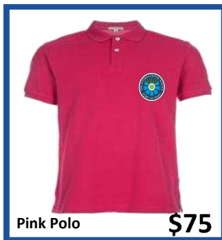
Pink Polo $75