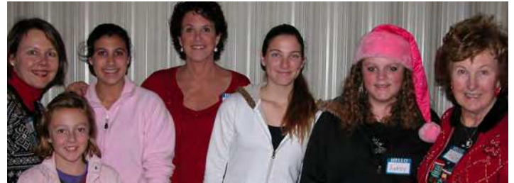
National Charity League mothers, daughters & a grandmother at the Holiday Party

National Charity League, Inc. Mothers AND Daughters SERVING COMMUNITIES Together®