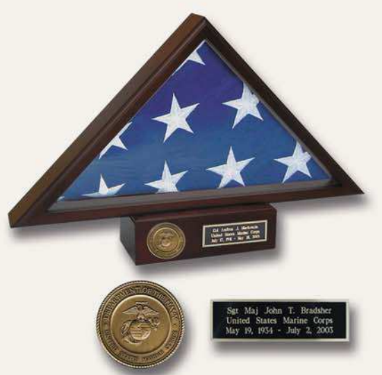
Medallion Flag Case in cherry with personalized plate and military seal medallion.