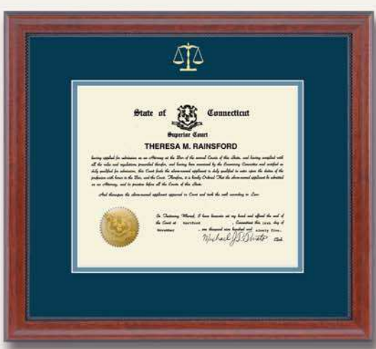
Navy and medium blue mat in Signature moulding.

You may choose from an array of specialty mat color options, frame moulding styles, and personalization features. Create your own unique frame or order one to coordinate with another Church Hill Classics frame. We offer gold or silver embossing of a variety of professional and military insignias, as well as the option of custom engraved brass plates.