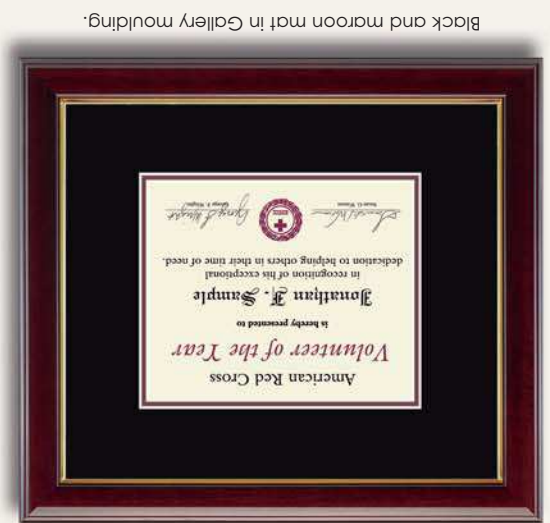
Black and maroon mat in Galleria moulding.