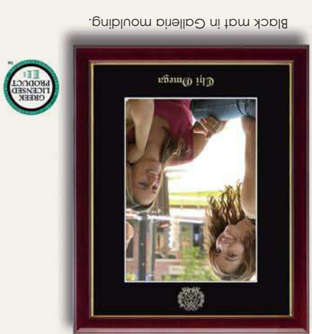
Black mat in Galleria moulding.

Church Hill Classics offers a comprehensive selection of certificates and photo frames customized for numerous fraternities and sororities. Our frames are officially licensed and will accommodate membership or initiation certificates, chapter charters, honors, or favorite photographs from your Greek experience. To view www.greekframes.com and search by organization name.