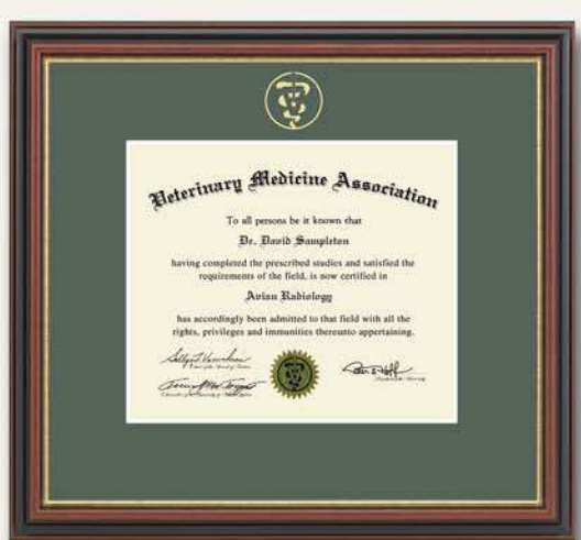
Williamsburg green mat in Regency Gold moulding.