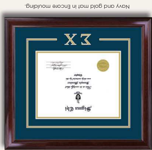
Navy and gold mat in Encore moulding.