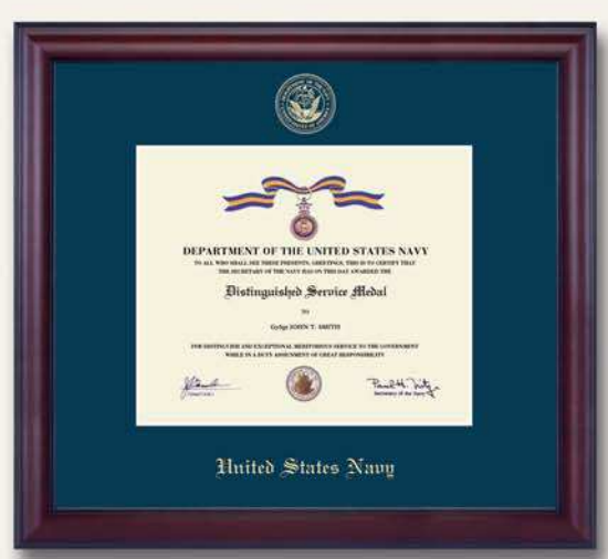
Navy mat in Cambridge moulding.

We offer a variety of frame and display case options for all branches of the U.S. military. To order visit www.diplomaframe.com and choose "Military Frames" from the "Frame Selection" menu.