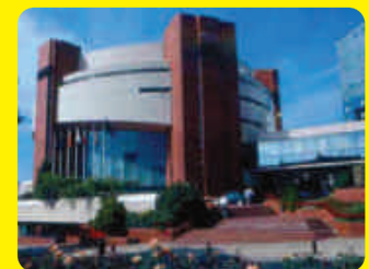
Harrogate International Centre

Not forgetting our delegates' great reputation for creating a highly sociable, friendly and fun event.