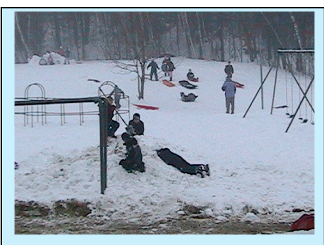
SLIDING SEASON HAS STARTED

Recess time has now become a great time to get out those sleds and go sliding. What a difference a little snow makes in recess time activities!