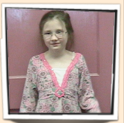
3 - Hunter Roast