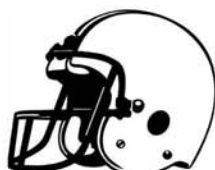
15 - FOOTBALL