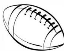
16 - FOOTBALL