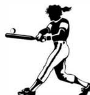
5 - SOFTBALL