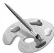
31 - VISUAL ARTS