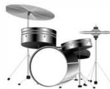
28 - BAND