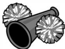
8 - CHEERLEADING