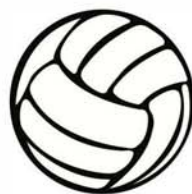
25 - VOLLEYBALL