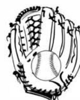
6 - BASEBALL