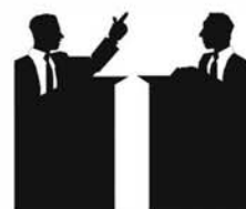
12 - DEBATE