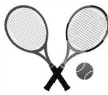
22 - TENNIS