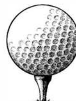
17 - GOLF