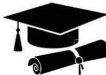
34 - SCHOLAR