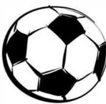
20 - SOCCER