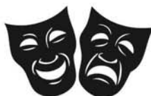
14 - THEATRE/DRAMA