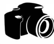
30 - PHOTOGRAPHY