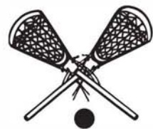
27 - LACROSSE