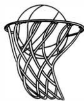
7 - BASKETBALL