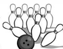
29 - BOWLING