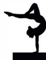
11 - GYMNASTICS