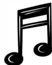
23 - BAND/CHOIR/MUSIC