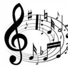
18 - BAND/CHOIR/ ORCHESTRA