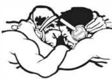
26 - WRESTLING