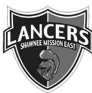
3 - LANCER