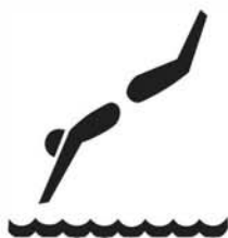
13 - DIVING