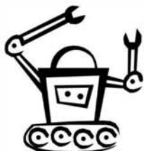
19 - ROBOTICS