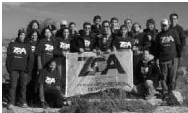
ZOA Student Leadership Mission to Israel, Winter Break 2005-2006. Feature story in the next issue of the ZOA Report.

ZOA maintains this list in strictest confidence, and never gives out your e-mail address! You may cancel any time; instructions will be at the bottom of each e-mail!