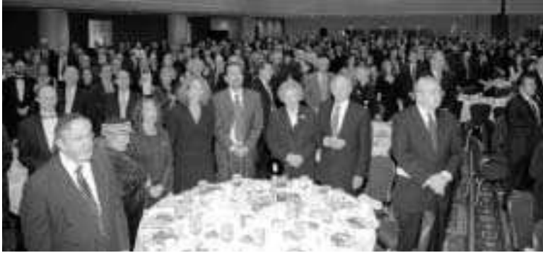
Inside the Marriott ballroom: this year's attendance at 1000+ was the highest ever.

Glick spoke of the current dangers facing an Israel led by old leaders "basing their policies on fantasy rather than reality ... The fantasy of Oslo was that Arabs want peace with Israel. The fantasy of Oslo was not replaced by a strategy for victory based on reality, but with a new strategy based on a new fantasy ... Sharon's new fantasy of disengagement is that while it is true that the Arab world in general and the Palestinians in particular have no interest in living at peace with Israel, Israel can deal with their hatred by unilaterally disengaging from the Middle East and holing up behind walls and barricades, turning on the internet and becoming immediately transported to a world where we will be safe. The disengagement from geographical and strategic reality that Sharon is advancing is in many ways more dangerous than the fantasy of Oslo..."