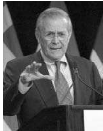
US Secretary of Defense Donald Rumsfeld