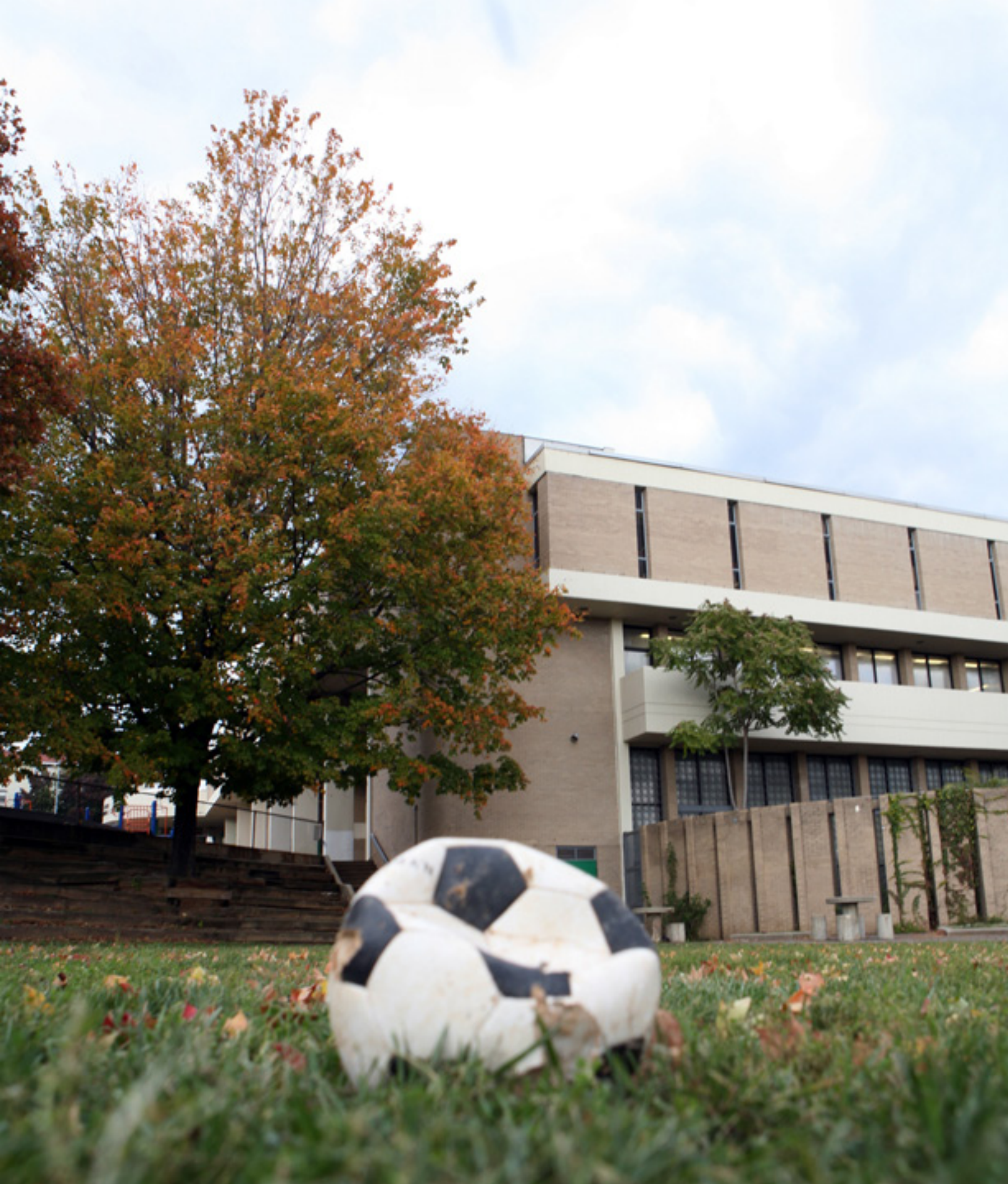
Marie Reed Community Center