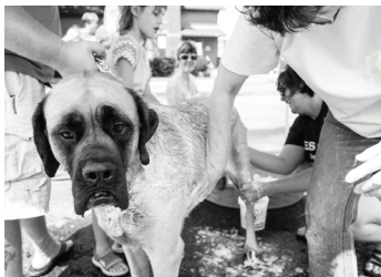
Summer car wash at Boudoir Noir.