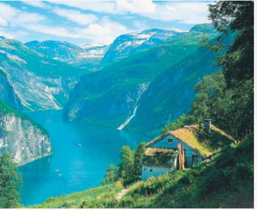
The natural wonders of Norway's waterways share the landscape with charming farms and fishing villages.

oin us for a unique, comprehensive, nine-day Scotland's rarely journey to visited Inner Hebridean, Orkney and Shetland Islands and Norway's majestic fjords, remote destinations forever linked by their Viking heritage. Cruise from Glasgow, Scotland, to Copenhagen, Denmark, aboard the exclusively chartered Five-Star small ship M.S. L'AUSTRAL with spacious, 100% ocean-view Stateroom and Suite accommodations. Travel in the wake of early Viking explorers, cruising into ports accessible only to small ships amid spectacular landscapes. Specially arranged excursions include a journey on The Jacobite steam train through the Scottish Highlands; Kirkwall in the Orkney Islands; prehistoric Jarlshof in the Shetland Islands; and the UNESCO World Heritage sites of Orkney's Neolithic Ring of Brodgar and Skara Brae, including a special presentation by local archaeologist and site director Nick Card, and Bergen's picturesque Bryggen. Enjoy exploring Norway's beautiful Hardangerfjord. A Glasgow + Edinburgh Pre-Cruise Option and Copenhagen Post-Cruise Option are offered.