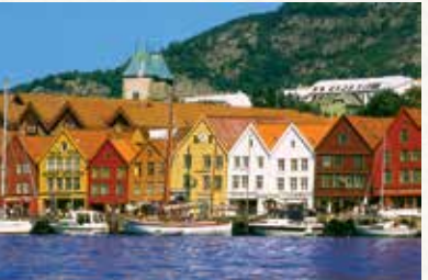
Bergen's Bryggen (the old wharf), a UNESCO World Heritage site.