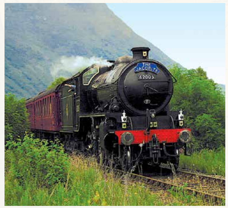
The Jacobite steam train, renowned as the Hogwarts Express in the Harry Potter film series, recreates the glorious era of rail travel amid the rugged beauty of Scotland's western Highlands.