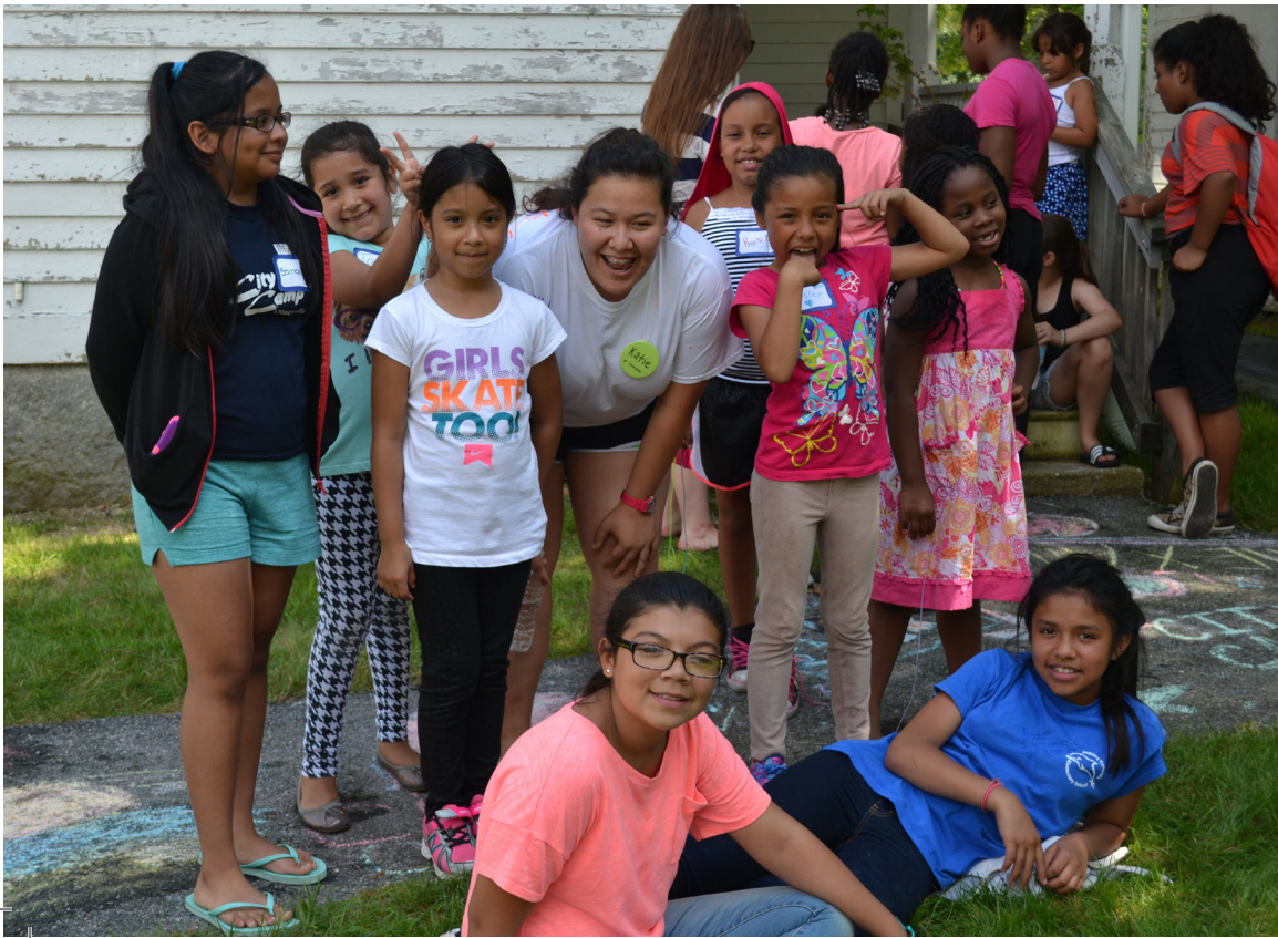
City Camp serves low-income families in Olneyville.

The Episcopal Charities Fund of Rhode Island 275 North Main Street Providence, RI 02903