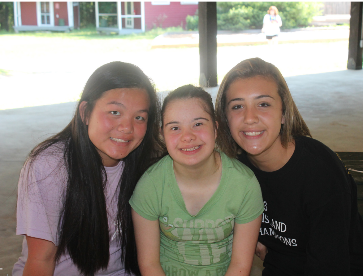
Bridge Camp at the Episcopal Conference Center serves people with special needs.

Give online at episcopalri.org/charities