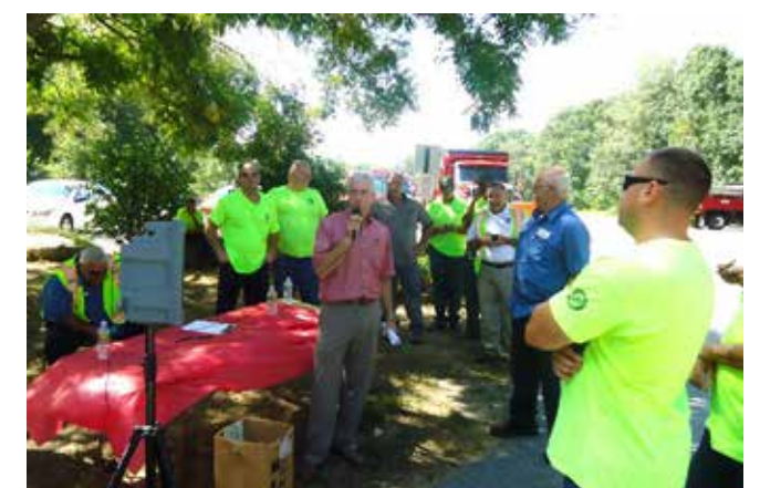
Providence DPW Director announces the winners