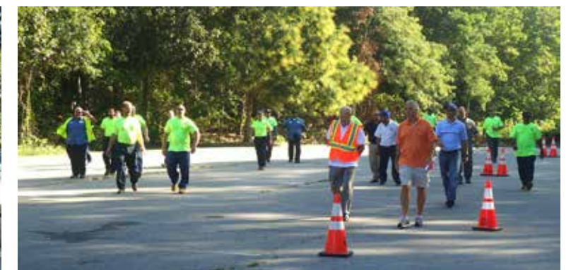
Judges conduct the walk through prior to the start of the Rhodéo.