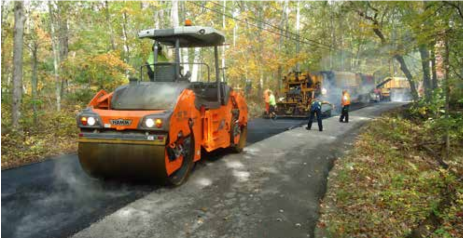
Hot In Place Recycling took place recently in Scituate and Coventry