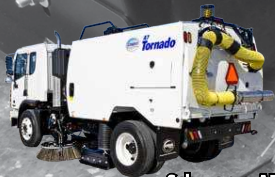
Schwarze A7 Tornado