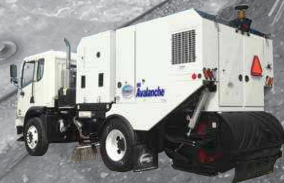
Schwarze M6 Avalanche