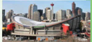
City Ice Rinks