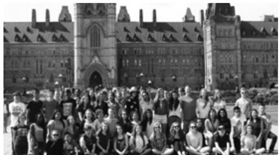
Our grade 9 classes during their trip to Ottawa.

School starts on September 2, 2014. We are looking forward to welcoming an amazing new crew of Grade 7.