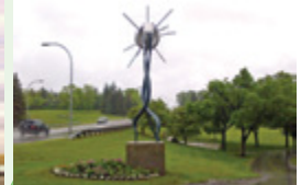
Rosemont Public Art