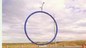
City Public Art