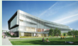
City Of Calgary's New Library