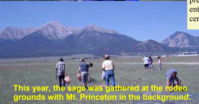
This year, the sage was gathered at the rodeo grounds with Mt. Princeton in the background.