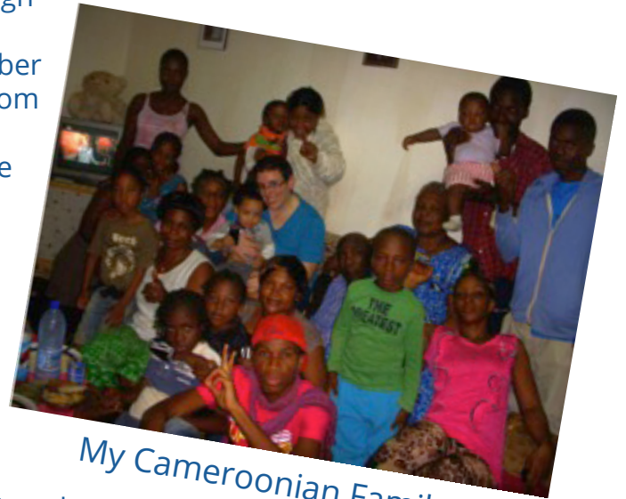
My Cameroonian Family

Ever since I was a young teenager in junior high school, I've had a passion for languages and cultures, especially African cultures. I remember occasions when I would hide myself in my room and just daydream about living in Africa, or when I would watch documentaries about the African people and have tears welling up in my eyes because I was touched by so many things about them: how they sang, how they moved and danced, their history, their unique appearance and the widespread poverty that so many of them suffer.