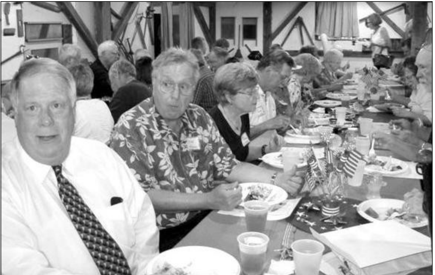
FULL HOUSE: Members turned out in full force for the June 21 Annual Dinner at Clayville. Tables were decorated in red, white and blue.