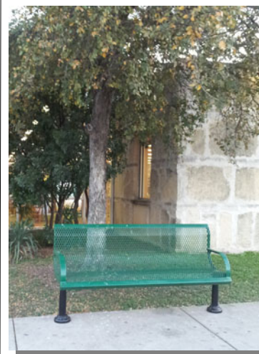
Great Northwest Friends purchased these great benches for their patrons to enjoy.