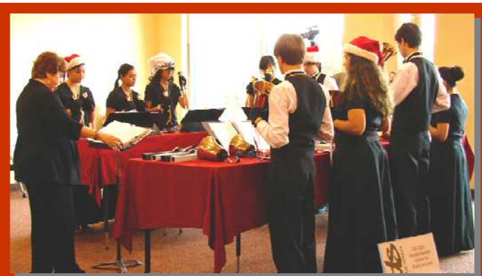
Bell Ringers from Antonian College Preparatory School helped Igo celebrate 5 years.