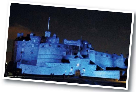
Edinburgh Castle, lit in blue to celebrate the UN's 70th anniversary