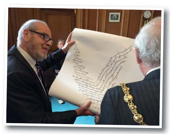
A local UNA group presents their mayor with a commemorative UN Charter to mark their community's support of the UN

Whether you choose to help us with a one-off donation or a regular gift, please don't forget to use the Gift Aid declaration to help us even more, at no additional cost to yourself. Thank you.