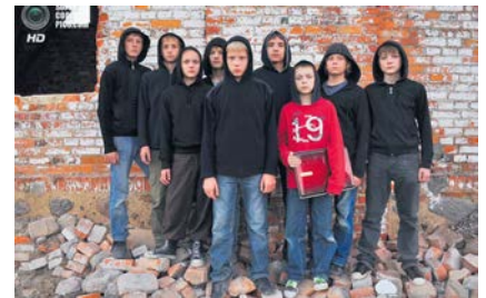
Sweet Young Things