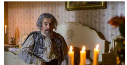
Duch Nad Zlato