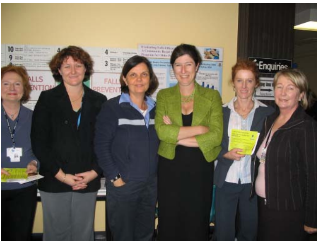
Some of the friendly staff manning the Falls Awareness week stall in the foyer of the Prince of Wales Hospital. The stall provided information pamphlets to both hospital staff and the public on falls prevention.

Falls awareness week also signified the start of a co-ordinated hospital wide approach to reduce the number of falls and falls related injuries occurring to patients during an inpatient stay.