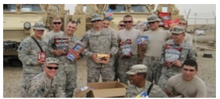
Care Package Drive November 1st-12th