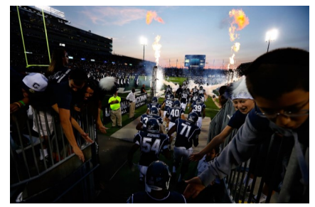
RSVP for the Tailgate by Oct. 31st!