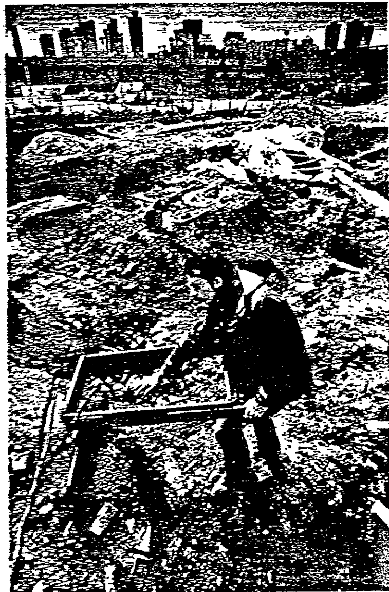
Harvard archaeologists dig at the site of future highway construction in Charlestown, Mass.