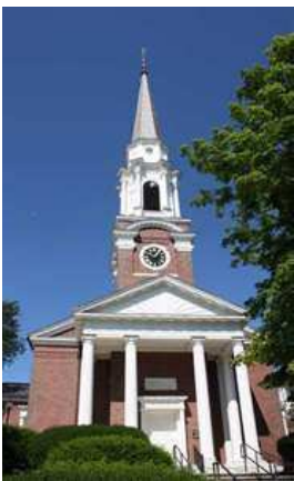
Wellesley Village Church