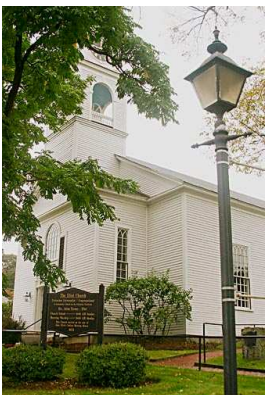
Eliot Church of South Natick