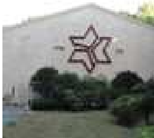
Temple Beth Torah, Holliston

July 18, 2011 Edition of the MIHN Newsletter