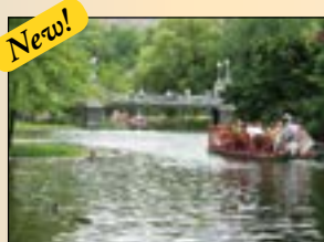
Thinking of You (1)