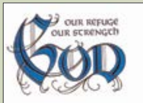
God our Refuge