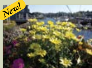
Happy Birthday (3)