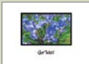
Get Well (2)