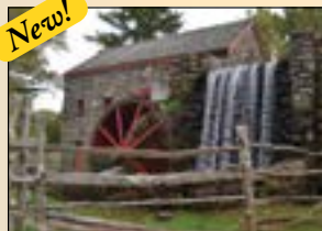
Thinking of You (3)