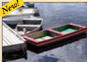
Thinking of You (2)