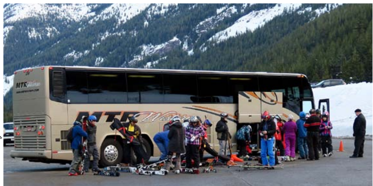
Unloading the bus, getting ready to ski