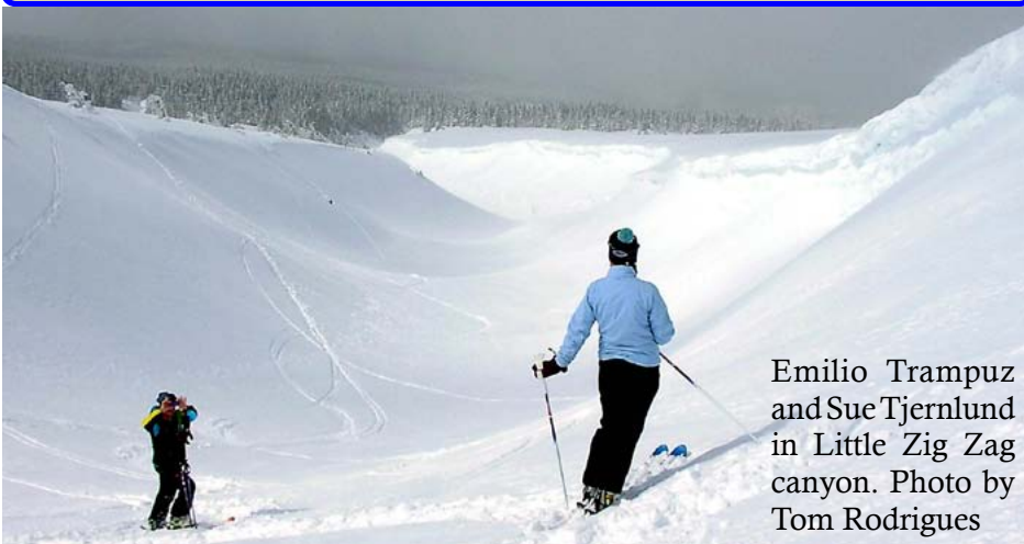
Emilio Trampuz and Sue Tjernlund in Little Zig Zag canyon.

Emilio will continue to offer guided tours of Zig Zag canyon, Little Zig Zag canyon, Sand canyon, and everything in between. Which parts we'll ski depends on the snow and on which lifts will be open.