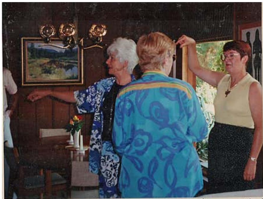
The 'mini Art tour' for the 7/10/97 Artists who opened their Homes for the '800' tour + helpers.