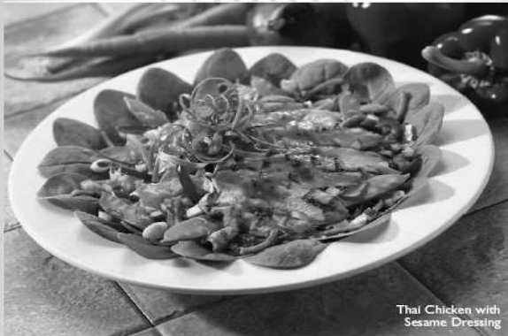
Thai Chicken with Sesame Dressing

Due to the overwhelming responses to Eating Fit, it is now going to stay on the main menu! Enjoy the flavors of Green Mill and be true to your commitment to eat healthy. Counting fats, calories or even dietary fiber? The Green Mill Eating Fit menu features healthier alternatives – many that meet the requirements of today's most popular diets.