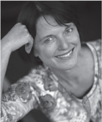
Sylvia Nasar, author of the best-selling book, A Beautiful Mind Revisited: The new brain research and John Nash's genius.