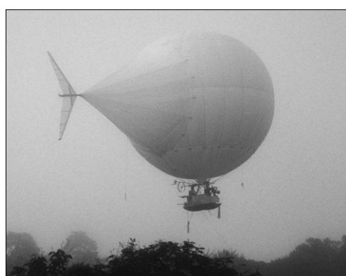
THE WHITE DIAMOND