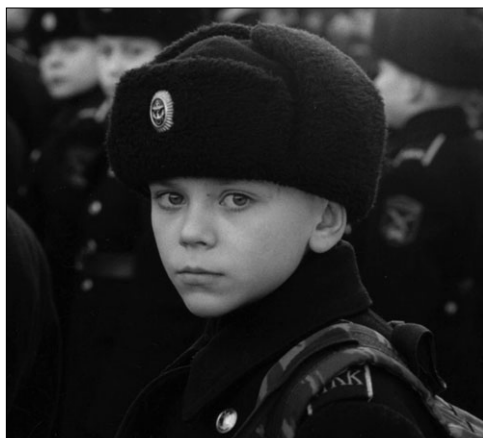
THE 3 ROOMS OF MELANCHOLIA