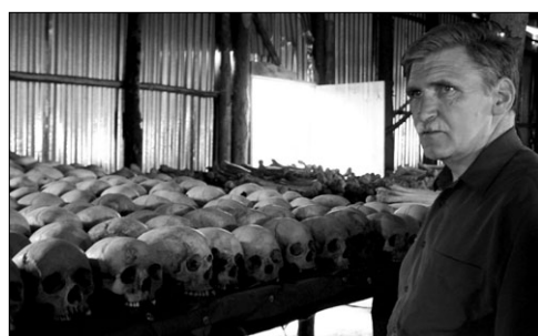
SHAKE HANDS WITH THE DEVIL