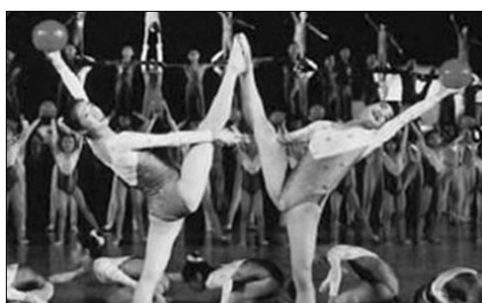
A STATE OF MIND