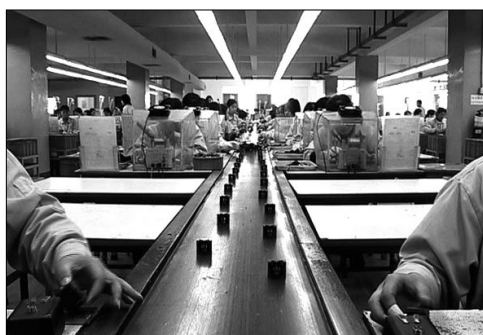
A DECENT FACTORY