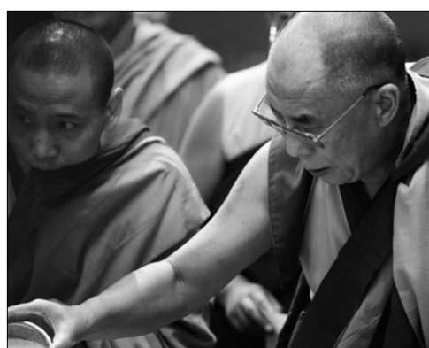
WHEEL OF TIME