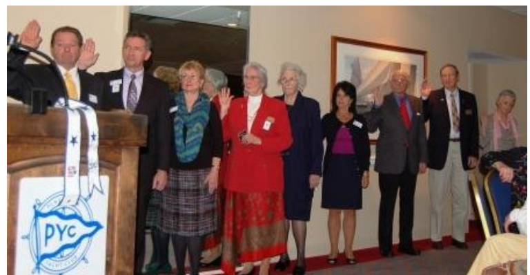
2014 Officers and Board Oath of Office