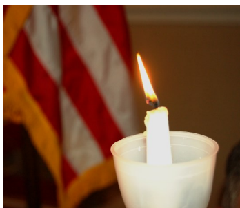
Memorial Service Candle