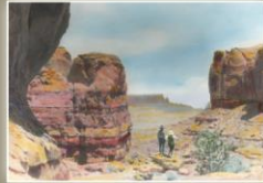
FAR VIEW MONUMENT VALLEY, UT