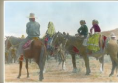
NAVAJO NATION MONUMENT VALLEY, UT