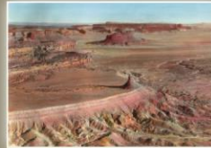
RED SUNRISE MONUMENT VALLEY, UT