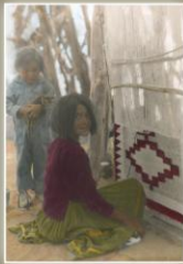
NAVAJO TRADITION MONUMENT VALLEY, UT