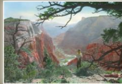
OBSERVATION POINT ZION NATIONAL PARK, UT