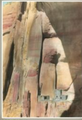
BETATAKIN NAVAJO NATIONAL MONUMENT, AZ

Hand-tinted lantern slides from the book LANDSCAPES ON GLASS _____ Greeting Cards