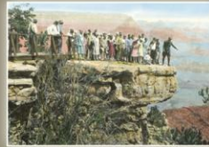
GRAND VIEW POINT GRAND CANYON NATIONAL PARK, AZ