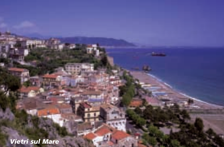
Vietri sul Mare