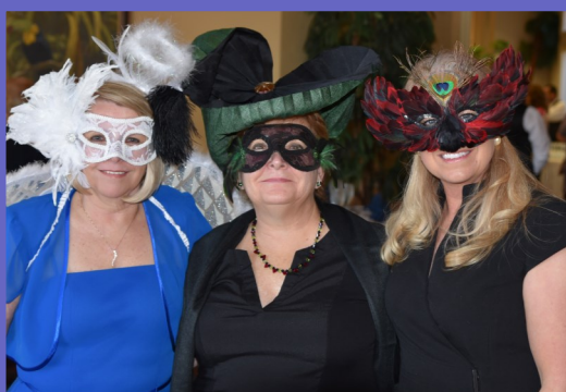
Nov. 1, 2014 Masquerade-themed tenth annual dinner and silent auction, at the Colonial Country

The Coalition appreciates the community coming together and supporting our efforts to end homelessness in Lee County. Many thanks to all of you for your support and contributions!