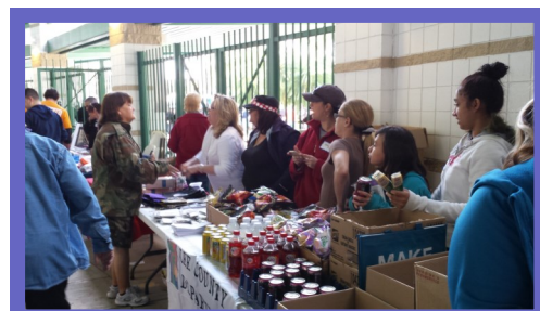
Homeless Service Day and Veterans Stand Down, January 2015