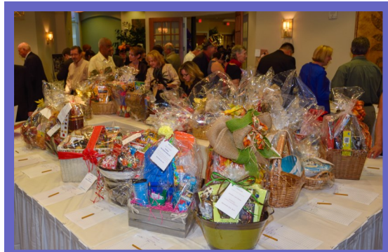
2014 Dinner and Auction