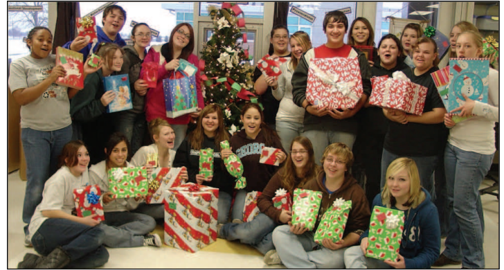
Campus FCCLA Members with gifts collected for the Angel Tree Project

the Angel Tree set up by FCCLA members in the Family and Consumer Science Department. FCCLA members boxed and wrapped the gifts and sorted the canned goods at their annual Christmas party. What a great opportunity to have fun and serve others!