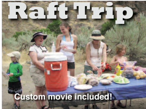
Custom movie included!

Meet: We will meet in the parking lot of Central Bible Church [time to be announced] and drive to Maupin, OR, where the raft trip begins. Return time to Maupin will be around 5 PM Tuesday.