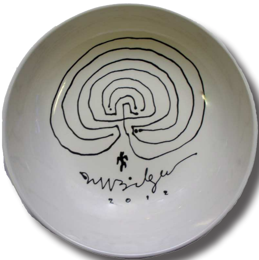
Oscar Winning Actor Jeff Bridges in 2012