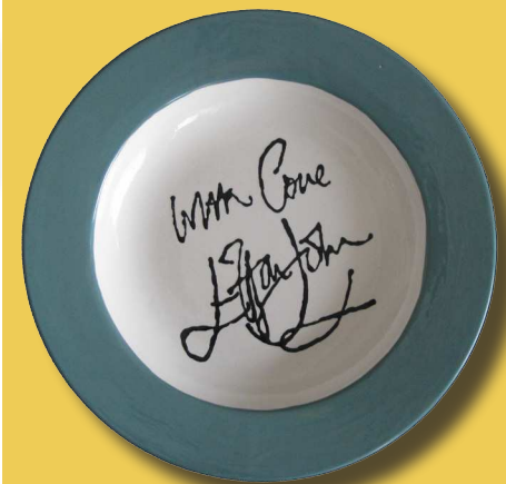
Musical Legend Elton John in 2009