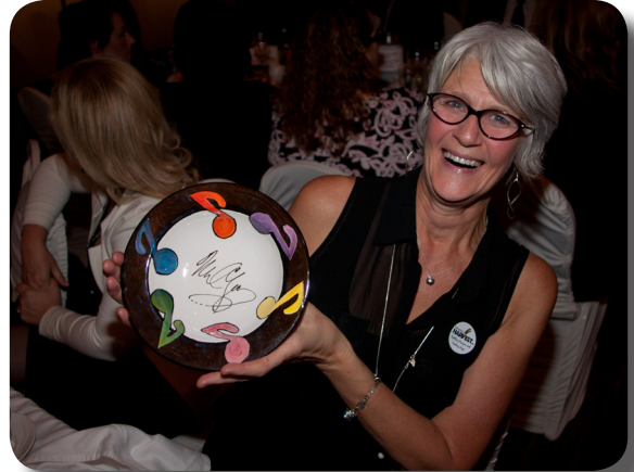
Winner of the Neil Young bowl in 2013