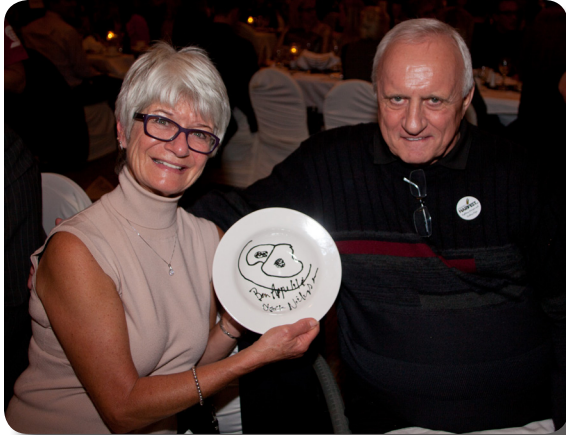
Winners of the Jack Nicholson bowl in 2013