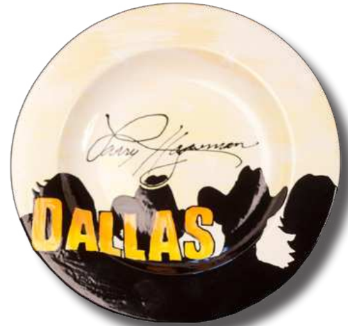
Larry Hagman in 2012

“Qualico is proud to sponsor the Empty Bowls Celebrity Auction and support the important work of Winnipeg Harvest in helping to address the challenges of poverty and hunger in our city.”