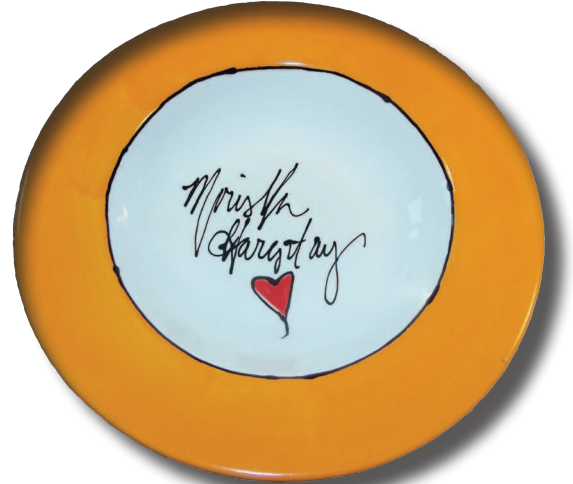
Mariska Hargitay in 2013