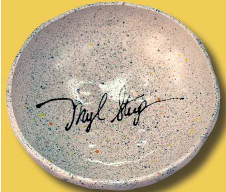
Three time Oscar winner Meryl Streep in 2012