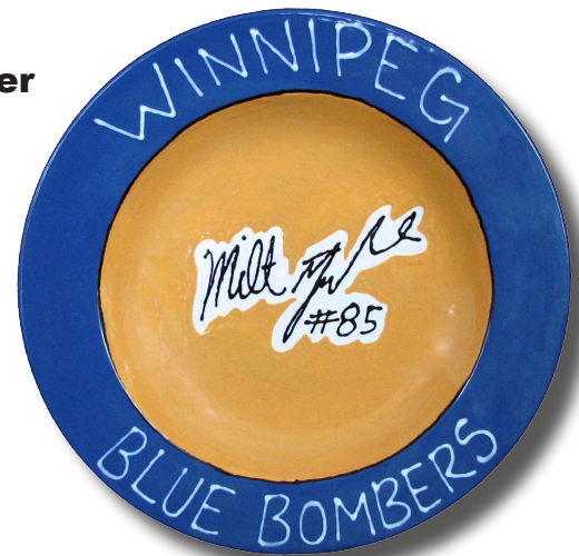
Milt Stegall in 2009

Help Winnipeg Harvest serve the needs of the poor and the hungry. For every Loonie donated, we can leverage $20 worth of food.