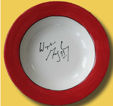
"The Great One" Wayne Gretzky in 2007