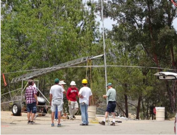
The 20m beam goes up Friday morning.